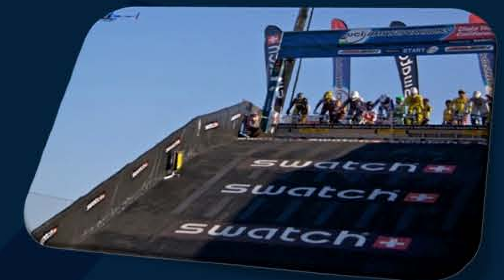
Union Cycliste Internationale BMX Supercross World Cup Competition included 140 Elite men and 32 Elite women from 21 countries. September 17-19, 2010